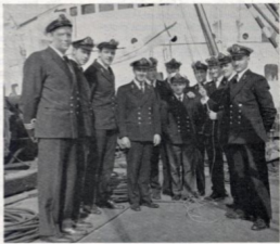
The cadet pennant is hauled down for the last time at the end of voyage 24